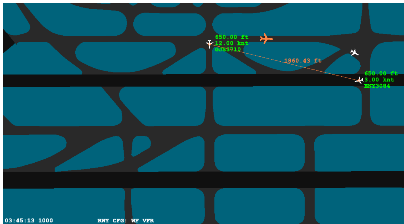
Figure 1 – ASDE-X presentation of ENY3084 and GJS3710 at 2145:13.

ASDE-X data for this investigation was obtained from the Federal Aviation Administration. Figure 1 shows the ASDE-X presentation just prior to ENY3084 starting takeoff roll. Figure 2 illustrates the ASDE-X presentation as GJS3710 is approaching runway 28 on taxiway F.